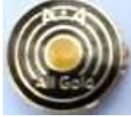
Field All Gold Pin