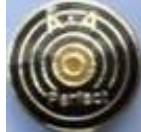
Field Perfect Pin